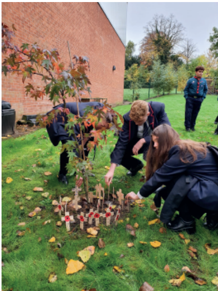
The Queen Elizabeth Academy, Atherstone