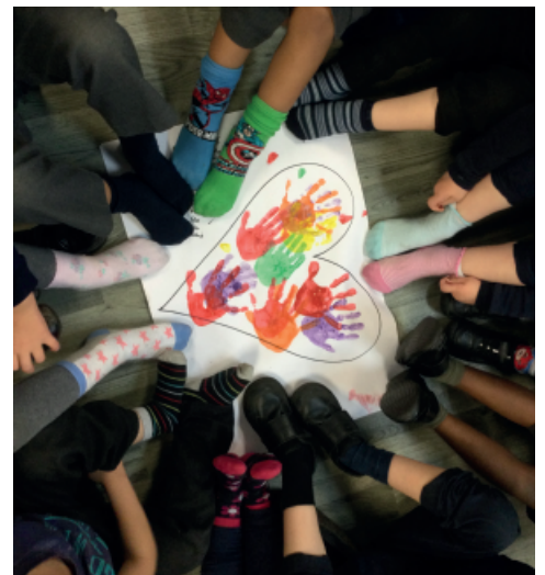
Star Academy kicked off Anti-Bullying week with Odd-Sock Day on 15 November.