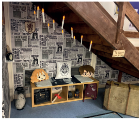
The Harry Potter themed reading space at Jubilee Academy, Walsall.