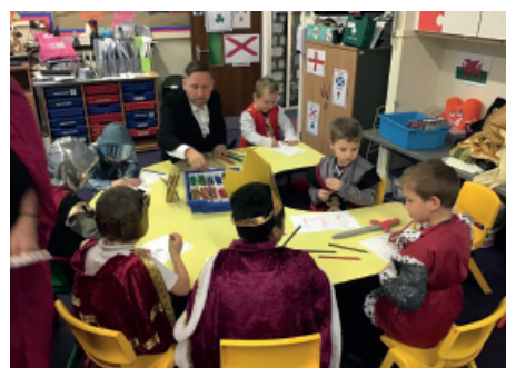
Sun pupils dress as medieval kings and knights...

At Sutton Community Academy , upgrades to the humanities and performing arts departments have been finished this term, with modern, open plan spaces offering access to a contemporary style of learning. There are plans to soon use Government funding to transform the drama studio into a public theatre, for use by the academy and local community.