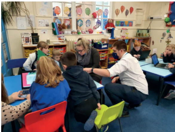
Mildenhall's computing workshop in progress at Icení Hockwold.

Over the past 18 months, the emergence of online learning has made the importance of teaching children digital skills abundantly clear. During lockdown, many of our disadvantaged students received devices to allow them to continue their learning at home, and our academies have done amazing work in facilitating the knowledge they need to excel.