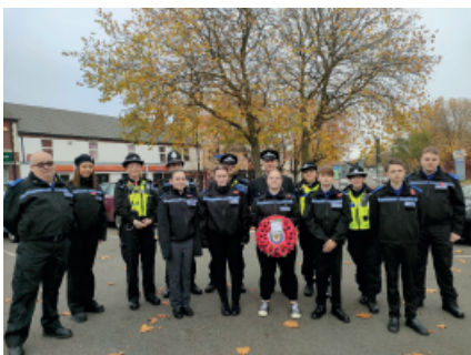
Bristnall Hall Academy, Oldbury

Over the last two years, our young people have missed out on social development and experiences that we would, in normal times, have been able to offer them. Our fantastic academies are doing great work to make up for this though, organising hands-on events to get children involved in culture.