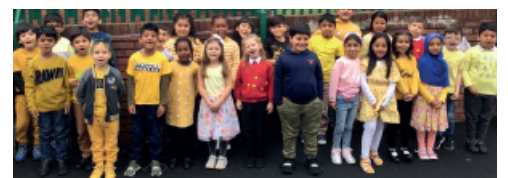
Caldmore pupils dressed in yellow to raise money for YoungMinds.