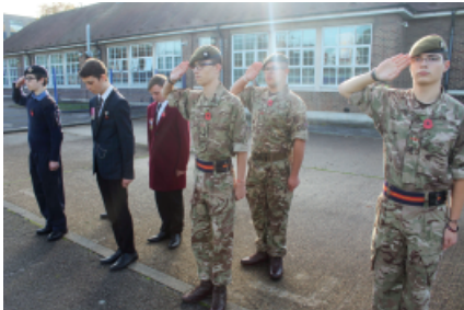
The Hathaway Academy, Grays