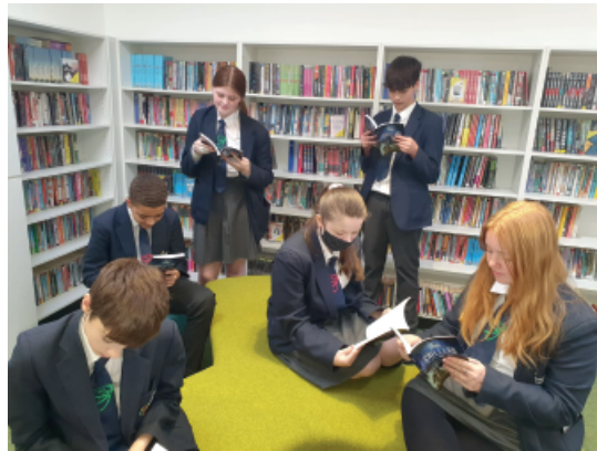
Bristnall Hall students reading through their published story in Spine Chillers ..

Our secondary academies have been working just as hard to encourage reading for fun- many of them have had visits and talks from well known authors . In addition to a visit from Diary of A Wimpy Kid author Jeff Kinney, Pool Hayes Academy has also introduced a ' reading advent ', where pupils are recommended a book every day in the run-up to Christmas. At Sutton Community Academy , pupils can pick a festive-wrapped book to take home for the holidays, with their choice based only on the opening lines of the novel displayed on the gift tag!