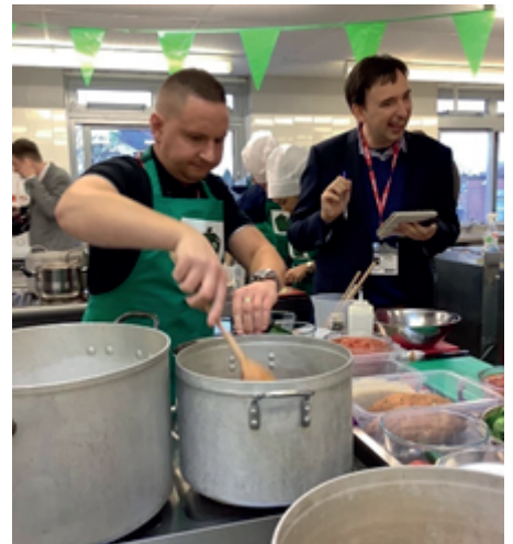
Nottinghamshire MPs participating in ATFE & SCA's Ready Steady Cook challenge.