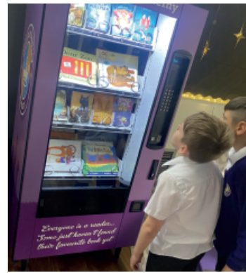
Two boys choose between books such as Roald Dahl's Fantastic Mr Fox and Judith Kerr's The Tiger Who Came to Tea .