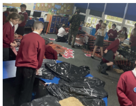
...and construct WW1 trenches.