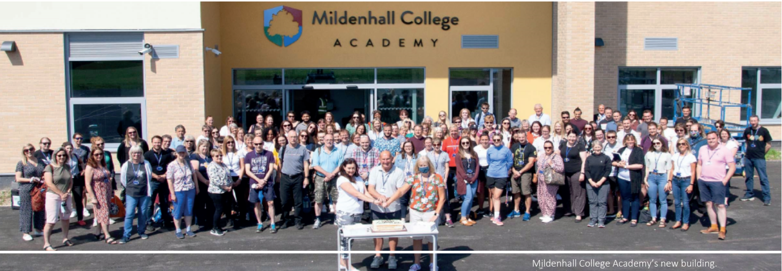
Mildenhall College Academy's new building.