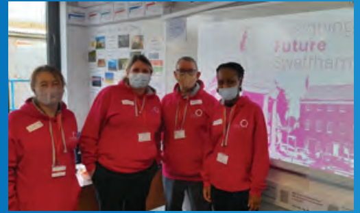
TNHA's community planning workshop

A scheme announced by Breckland Council & Historic England includes a range of projects with the aim of protecting the historic high street and to look at how it can be further enhanced for residents and visitors in the future. Following a survey canvassing their views on the future of Swaffham, a group of students from TNHA have been working hard on a one such project with architects Urban Symbiotics . The objective of the first workshop was to design an aspect of Swaffham with a team including an architect, urban designer, landscape architect and heritage consultant. The second session, which will take place in a few weeks, is to formulate a poem for the future of Swaffham which will be developed into a commissioned poem by the poets who visited, using material from the workshop.