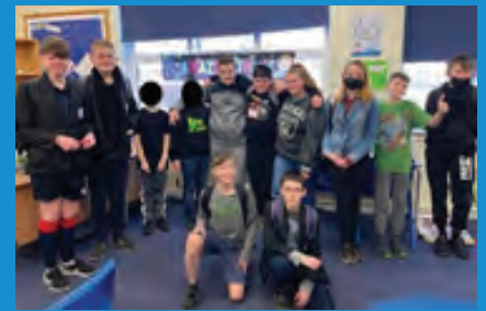
Iceni Academy's brilliant bowling team!

12 ambitious students have represented Iceni Academy at the Norfolk Schools Games Partnership Panathlon Bowling Event in Brandon this March. Competing against other local academies, the students formed two enthusiastic teams of 6, collaborating and supporting each other brilliantly. Their advice and encouragement to one another as well as towards other the schools demonstrated fantastic sportsmanship. Iceni Academy earned medals for the Year 7 team, who performed amazingly. The Year 8-10 team came away with the Gold Medal Winners Trophy , and awards for Most Strikes and Spares and Highest Score ! The students had an amazing time and were a credit to their academy- and they can't wait for the next event!