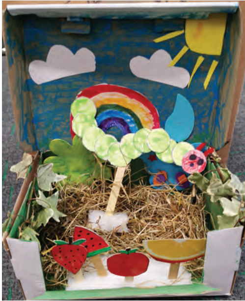
A diorama made by a pupil at Great Heath Academy