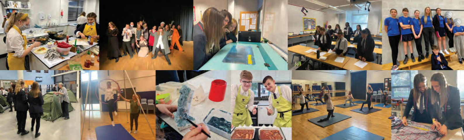
A glimpse into some of the Queen Elizabeth Academy's wide range of clubs and extracurricular activities

Our academies also offer an incredible range of clubs for learners to participate in. The Queen Elizabeth Academy is particularly proud of their extensive offer for extracurricular learning; this includes developing some unique skills in the likes of the Yoga Club, Circus Club and Young Artists Club, as well as more traditional activities in sports leadership, creative writing and performing arts. In the STEM club, budding scientists have explored a range of topics including Engineering in a Pandemic , where they made a model virus and a face mask testing machine, Robotics , in which they built robots to enter into a competition, and Sewing Bee , which has kept them very busy; first they made bags for GEH Breast cancer care, then moved on to other designs including pencil cases, gift bags, and even christmas stockings. For the TQEA Young Reporters, what started as a weekly article in the student newsletter has grown rapidly. The reporters have established TQEA Talks, a broadcast designed to showcase amazing work and opportunities happening at the academy.