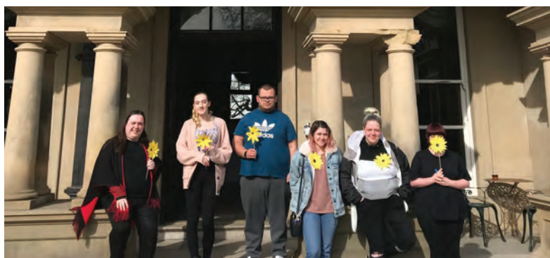
Further Education learners enjoying the outdoors at Alfreton Hall