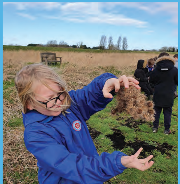
Iceni pupils learning about local nature with the RSPB

Learners on ATTFE College's horticulture course have been in their element in the spring sunshine. On a visit to Alfreton Hall, they've been learning about sunflowers, the national flower of Ukraine.