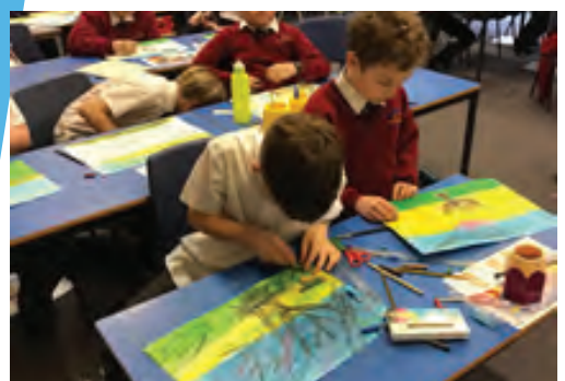
Sun pupils practicing therapeutic arts and crafts