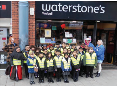
NWPA pupils ready to redeem their book tokens