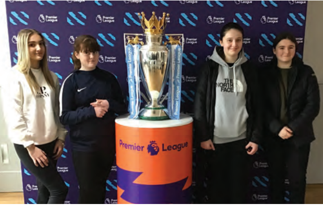
Sutton Community Academy students at the PL Changemakers event

We have the highest aspirations for all our learners and colleagues, so we were proud to see our academies celebrating International Women's Day on Tuesday 8 March. Students from Sutton Community Academy represented the Nottingham Forest Community Trust at a Premier League Changemakers workshop focusing on female leadership, hosted by the AVFC Foundation. At ATT FE College , adult learners have been researching and developing projects on inspirational women throughout history and in their own lives. The ' FE'nominal colleagues also wore pink, red, and orange in celebration.