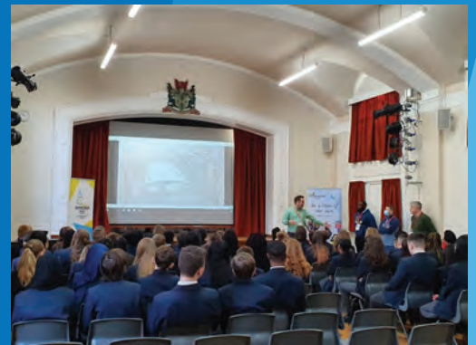
Bristnall Hall students were interviewed by the BBC after a talk from the project directors