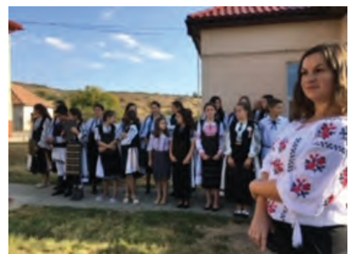
Schools across Europe took part in the project