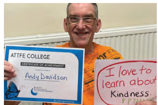
An FE learner enjoying Celebration of Learning Week.