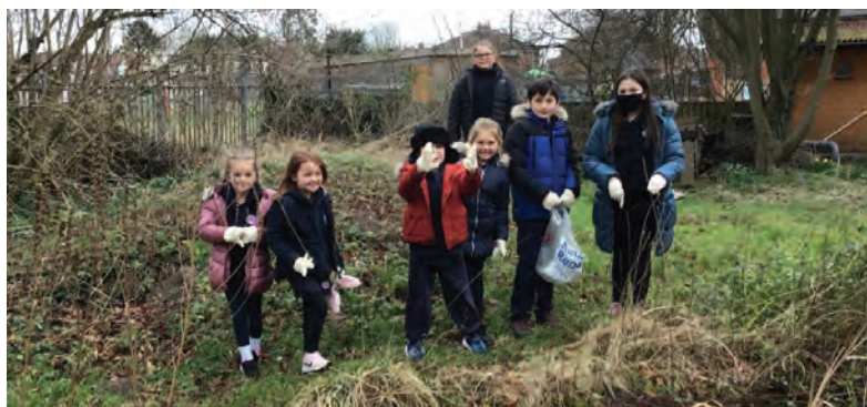
Iceni's Eco Club gets mucky whilst searching for signs of spring in the school garden