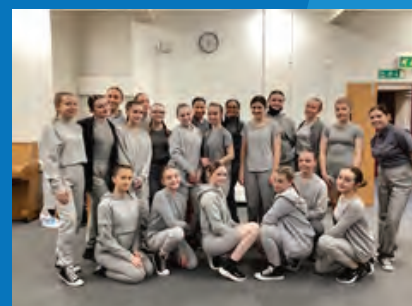
PHA's avant garde masterclass