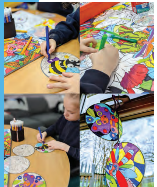
Phoenix Academy's Wellbeing Art Club