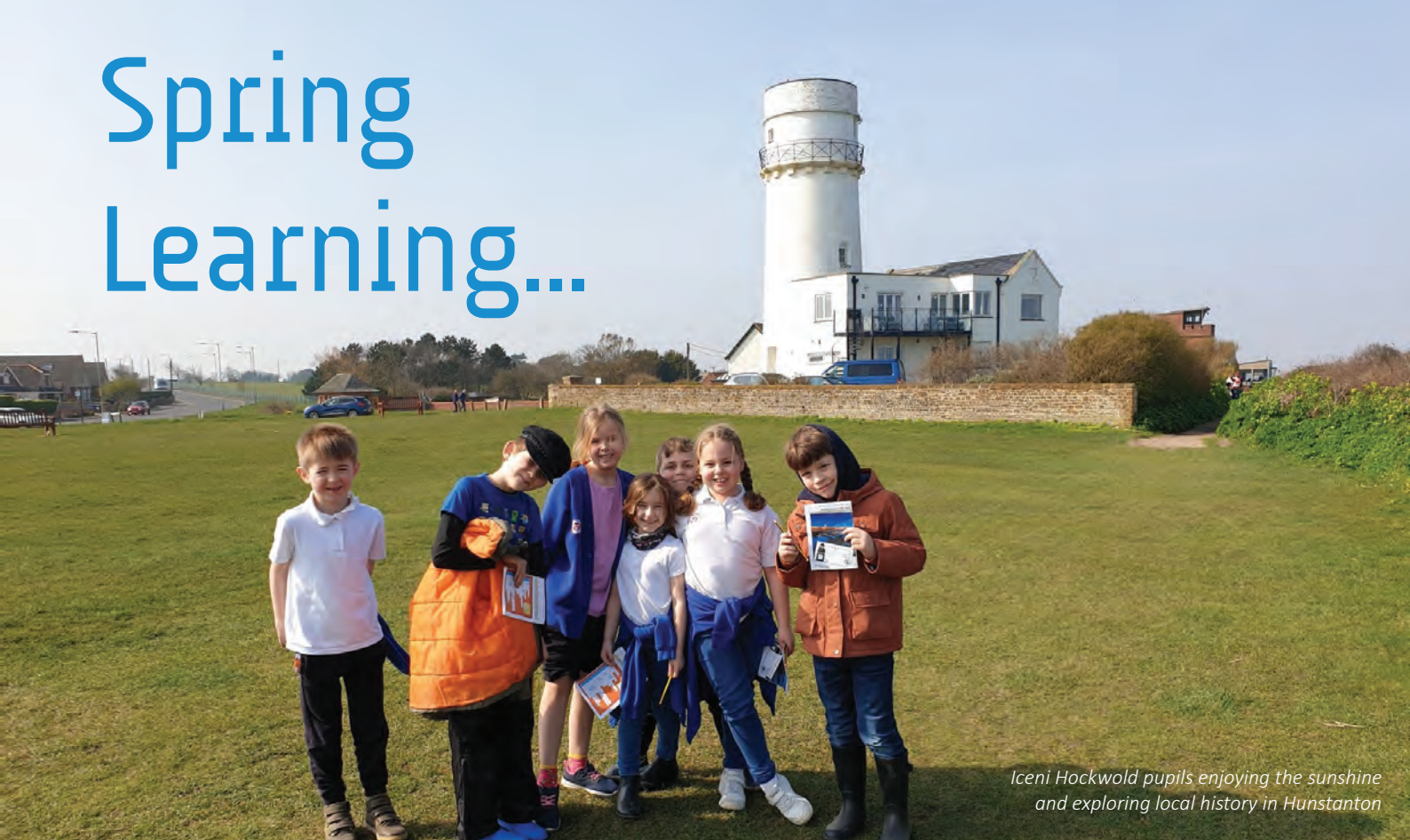
Iceni Hockwold pupils enjoying the sunshine and exploring local history in Hunstanton

As winter retreats and the days are becoming ever warmer and brighter, the spring sunshine is affording pupils across our academies valuable opportunities for outdoor learning. Pupils at Iceni Hockwold Academy have been exploring science, geography, and history outside. They've learnt about both the recent and ancient history of their village, visiting war memorials and a local Roman settlement. As well as participating in a workshop on life cycles with RSPB Lakenheath, pupils in the Eco Club took advantage of the sunshine to explore signs of spring in the school's garden whilst picking litter, sowing wildflowers and feeding the birds.