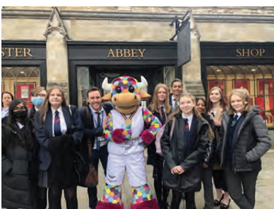
The students outside Westminster Abbey

The Royal Commonwealth Society encourages schools to explore and engage with the core Commonwealth values- important principles of human rights, rule of law, democracy, and stewardship of the environment. This Commonwealth Day was a particularly special one, marking the Platinum Jubilee of the Society's patron, the Queen, and her seventy years' service to the commonwealth.