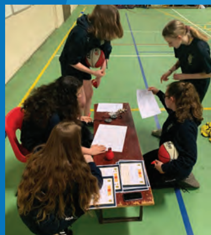
Dukeries' hardworking Sports Leaders